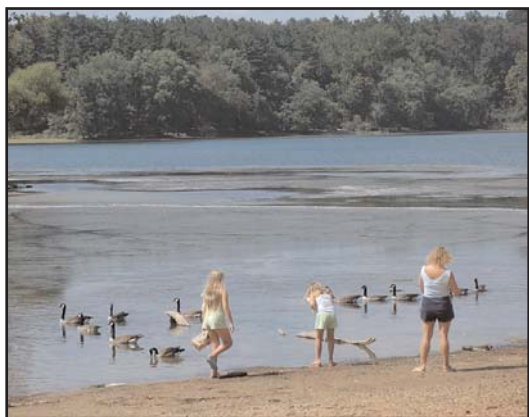
Public education lets people know why it's in everyone's best interests to let geese forage for themselves.

health and can increase the spread of diseases, such as avian cholera, avian botulism, and “duck plague,” among geese and other birds.